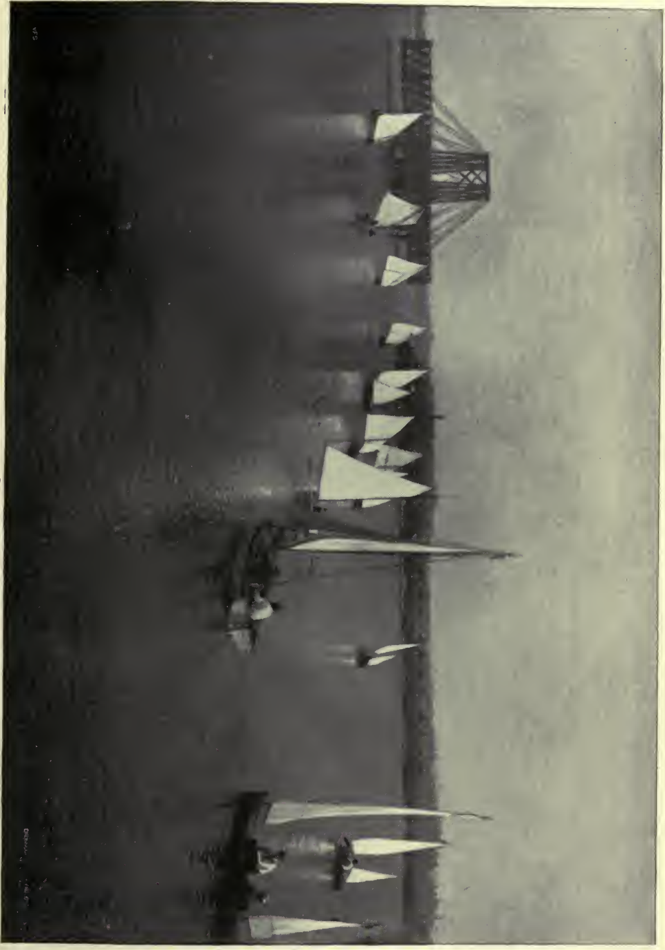
THE MOSQUITO FLEET ESCORTING THE CORINTHIAN YACHT CLUB FROM OAKLAND HARBOR.