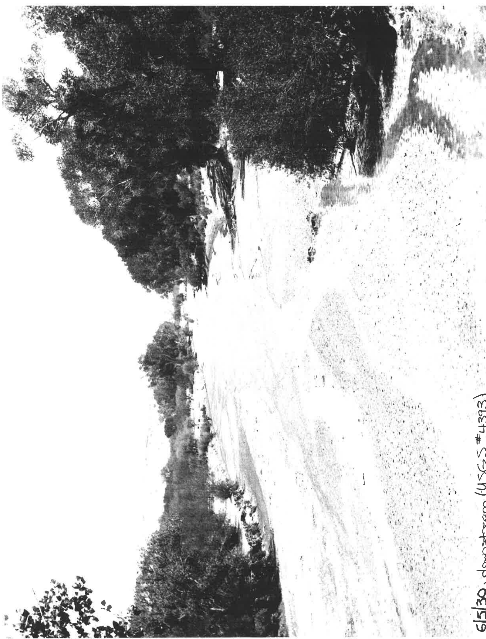
6/5/30, downstream (USGS #4393)