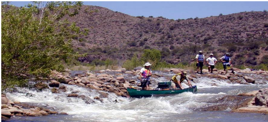
Verde River May 2002. Canoe walked to avoid swamping generator. Other canoes ran this rapid. 100 cfs