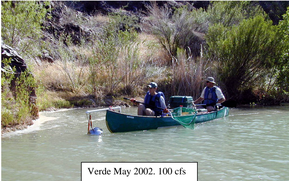
Verde May 2002. 100 cfs