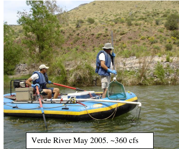
Verde River May 2005. ~360 cfs