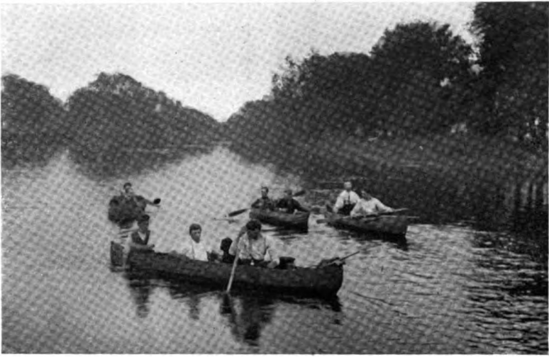
Making ready for a landing for the night