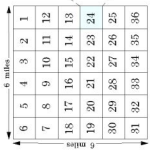
SAMPLE SECTION SHOWING DIVISIONS