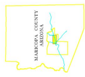
SECTIONAL MAP OF T2N, R5E AND T1N, R3E