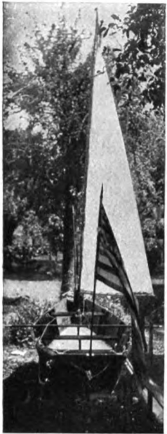
A home-made boat that cost, without sail, $10

I F YOU want a canoe, go and buy one. A young house-carpenter confessed to me the other day that he had just spent $35 for material in trying to imitate a $30 canoe!