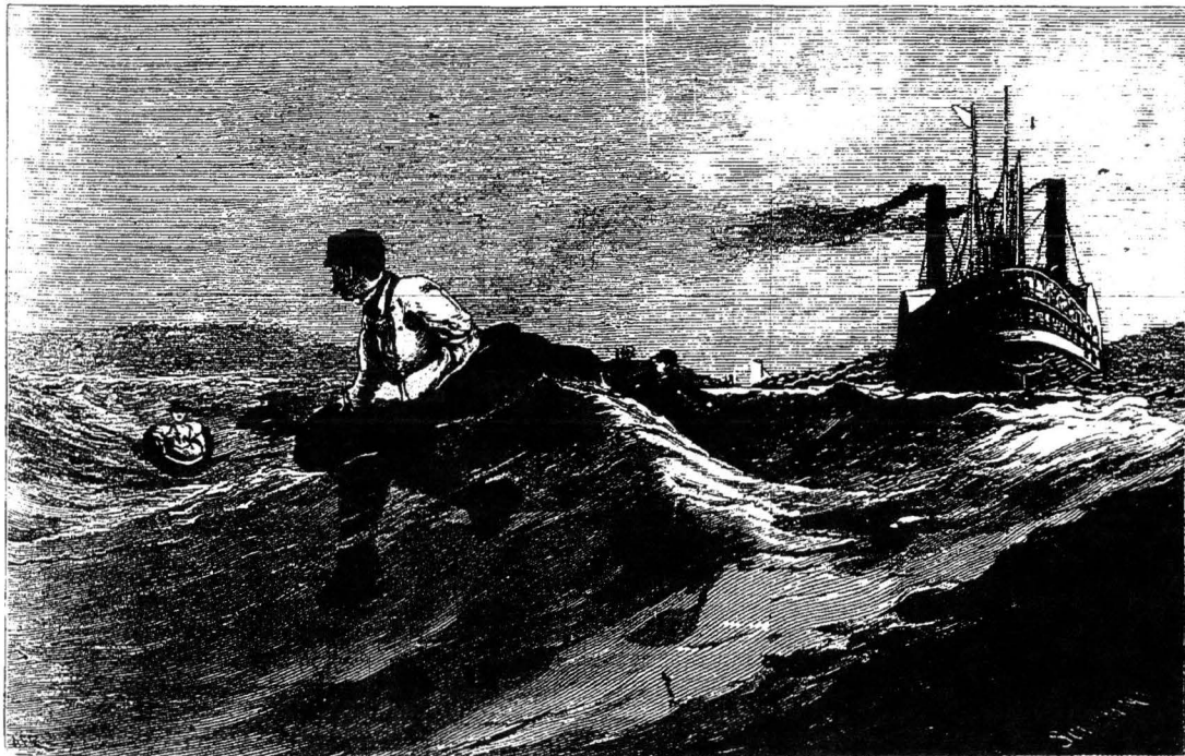
PASSAGE OF HELL GATE, EAST RIVER, N. Y., IN THE LAYMAN BOAT.

this. The best one is very easy to manage, so as to effectually break up those lines which appear so prominent in skies and foreground. Cover the engraving which is to be copied with a thin and finely ground piece of glass, the polished side downward. This glass must be exceptionally clean, and to insure this it should be brushed over with ammonia or nitric acid, afterward well water-washed. When the glass is in position it will be seen that the engraving, viewed through the glass, has the appearance of a pencil drawing. No lines are visible, but a general softness has taken their place. Of course it would be perfectly useless to photograph the print in this condition. To restore vigor to the important parts of the picture, go over the ground glass surface with a brush dipped in oil, painting, as it were, every portion except the sky and the immediate foreground, where the objectionable lines usually are to be seen. This operation will give the desired blackness, thus rendering the print capable of producing a first-class negative. If this method be adopted, the result will prove most satisfactory, for it will be impossible to distinguish the obnoxious lines.—Photography.