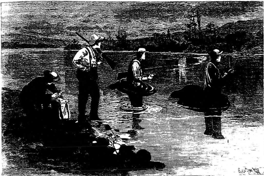
THE LAYMAN BOAT USED IN DUCK SHOOTING.

and as the body of the boat takes the water the launch is made. By sitting comfortably on the bottom of the boat and paddling with the feet, a progress of two or three miles an hour can be made in any direction.