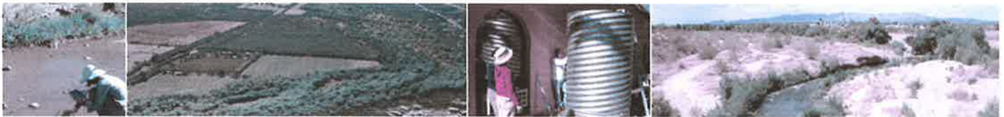
Researchers Day 2010

ABOUT US | WHERE WE WORK | WESTERN ISSUES | SUPPORT OUR WORK | LIBRARY