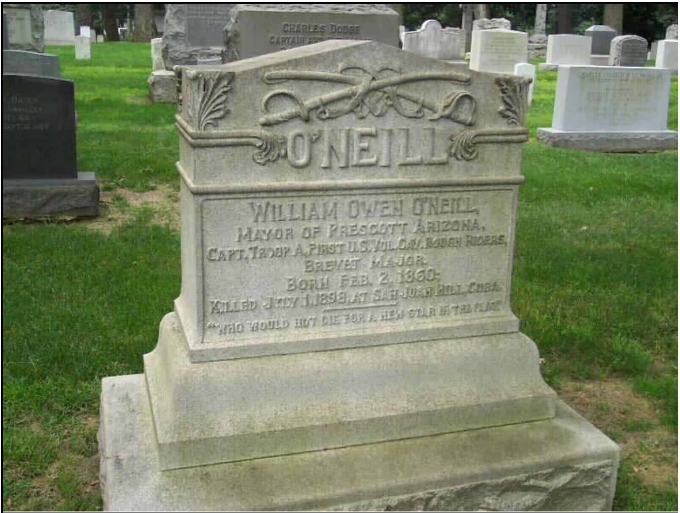
28 June 2003