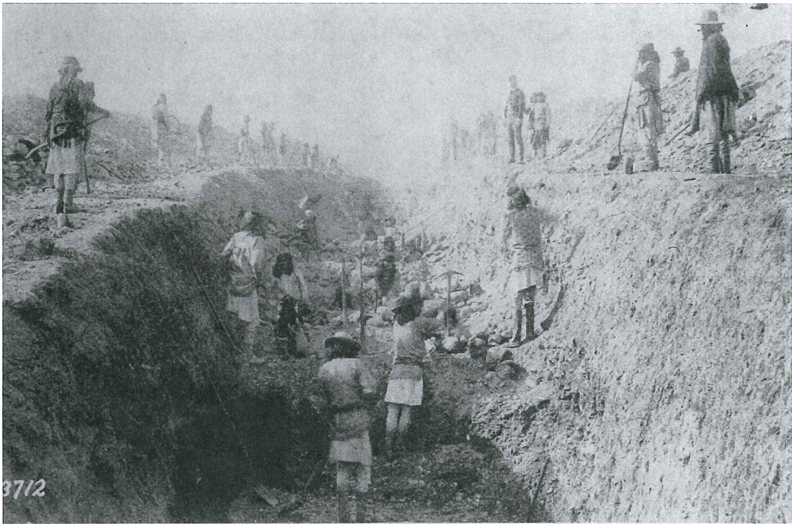
"Irrigation ditch under construction at San Carlos Indian Agency, Arizona-1 886." 111-SC-83712