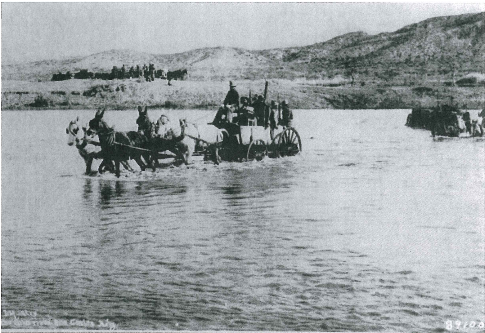
Co. B~ 10th Infantry~, crossing Gila River in buckboard wagons near San Carlos, Ariz. Terr., ca. 1885. 111-SC-89105.