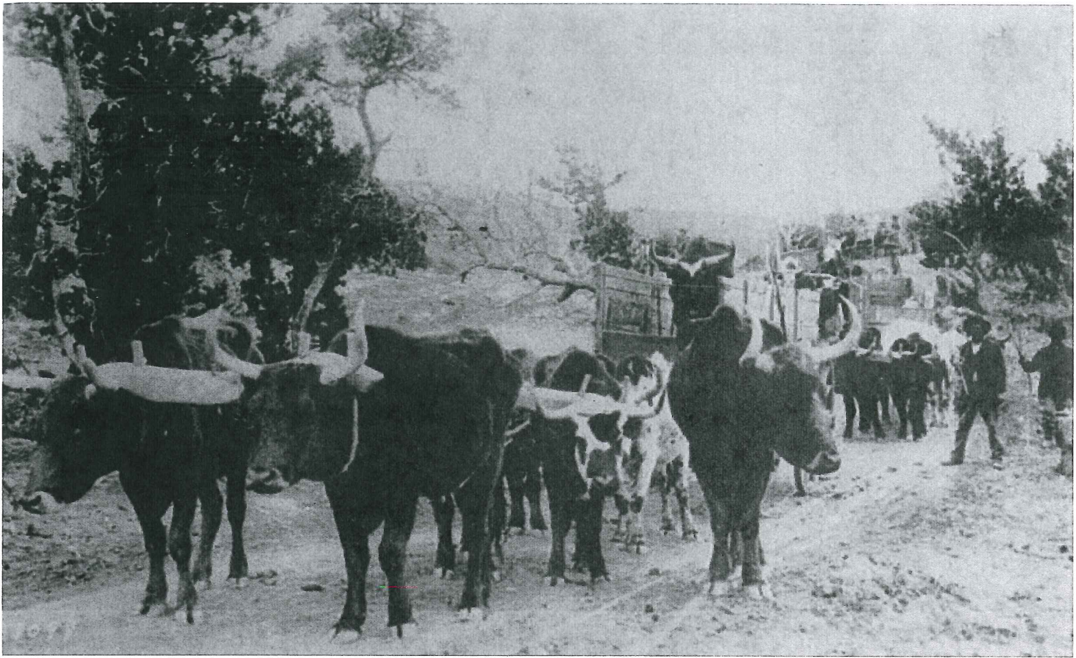
Ox train used to transport supplies in Arizona Territory, 1883. 111-SC-89099.