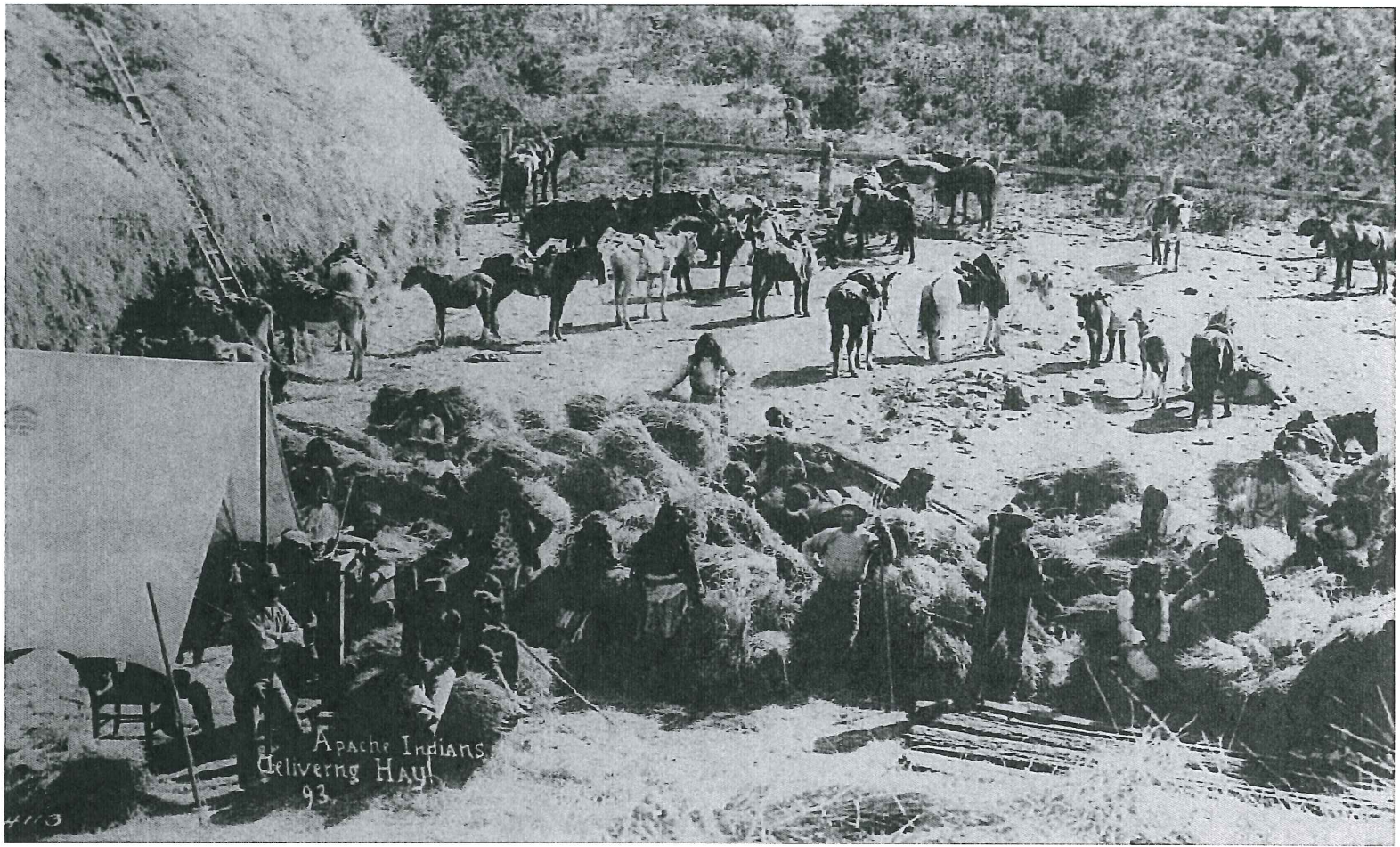
"Apache Indians delivering hay, Fort Apache, Ariz., 1893." 111-SC-104113