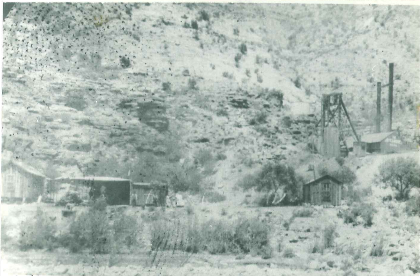
Gold Tooth mine. Sec 7, T17N, R3E, G+SR m. ARIZONA