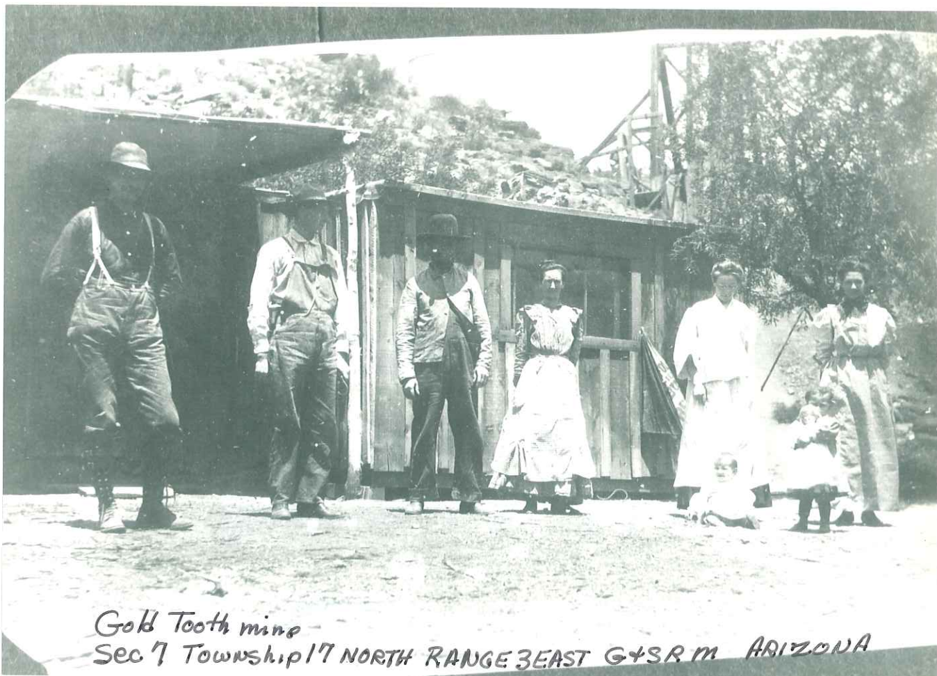
Gold Tooth mine - Sec 7 Township 17 NORTH RANGE 3 EAST G+SR m ARIZONA