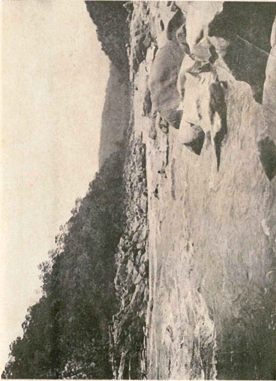
1167 The Narrows of the Yadkin, 1500 feet wide just above the Narrows. Salisbury, N.C. Pub by Buerbaums Book Store.