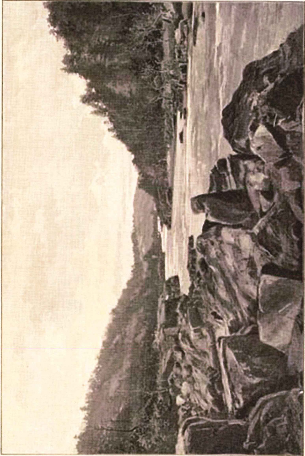
WATER POWERS—NARROWS OF THE YADKIN.