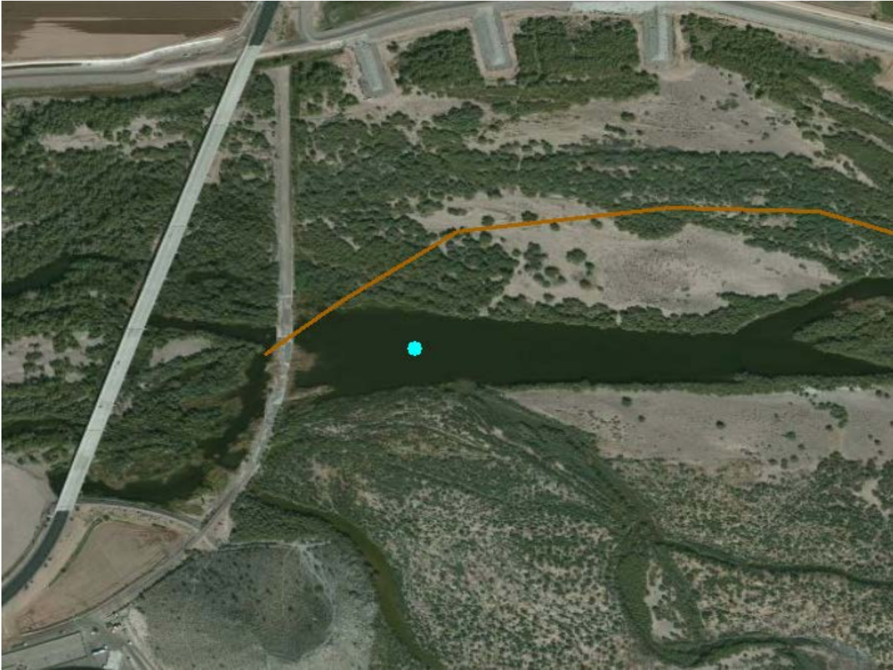
Figure 7. Downstream end of Segment 6 at Gila River confluence.