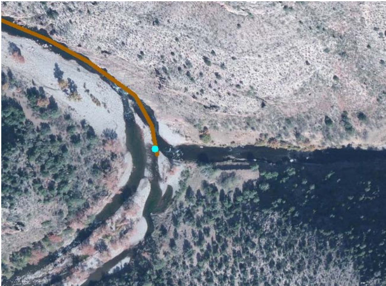
Figure 1. Upstream end of Segment 1 @ confluence of White & Black Rivers