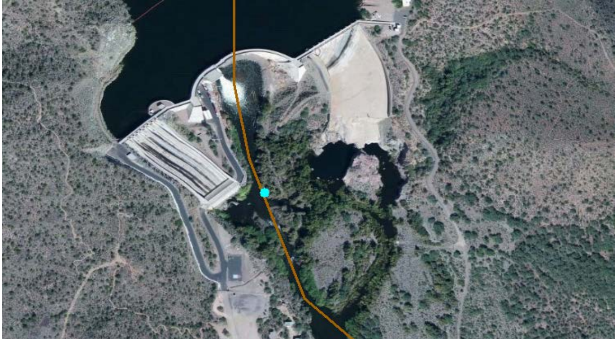
Figure 5. Upstream end of Segment 5 at end of canyon reach and just downstream of present location of Stewart Mountain Dam.