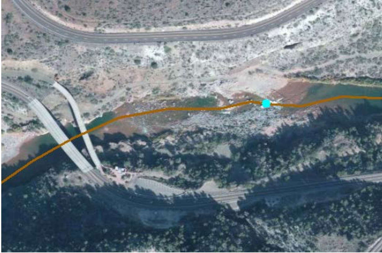
Figure 2. Upstream end of Segment 2 just below Apache Falls Rapid.