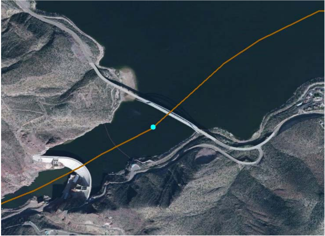
Figure 4. Upstream end of Segment 4 at entry to canyon reach and just upstream of present location of Roosevelt Dam.