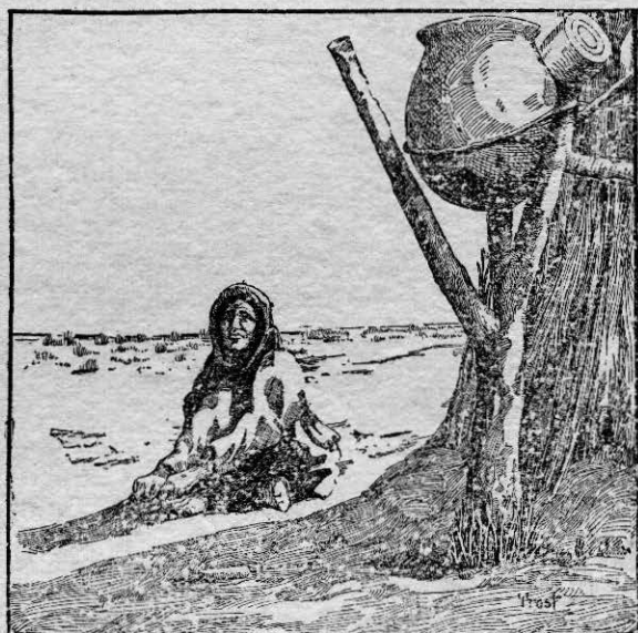
THE VALUE OF WATER IN AN ARID LAND A Papago Squaw near Quitovaquito, Arizona, utilizing the drip from her olla to grow a few onion plants beneath, protected by a paling of sticks.

A reprint of Bulletin No. 235, Office of Experiment Stations, U. S. D. A., being No. 2 cooperative, by the U. S. Department of Agriculture and the Arizona Agricultural Experiment Station