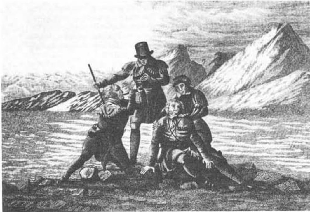
Messrs. Pattie and Slover rescued from famish.