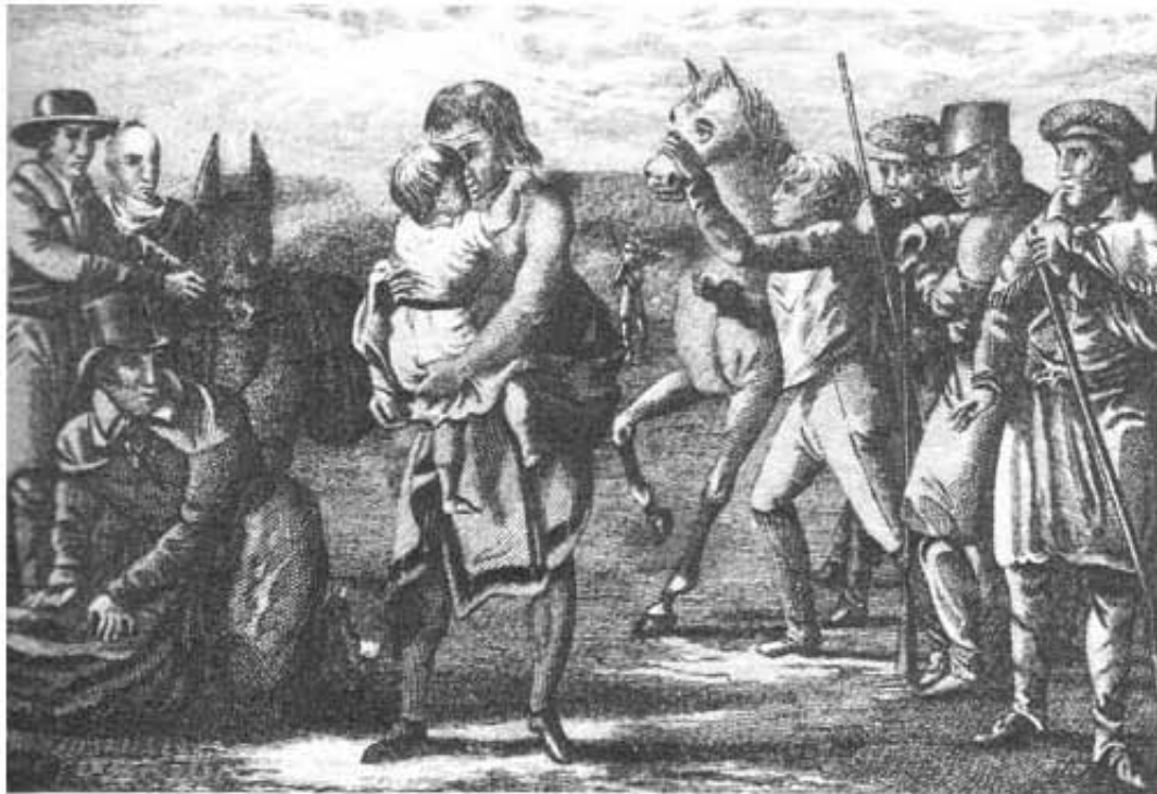
Rescue of an Indian child